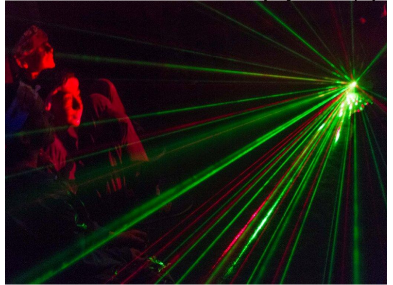
A vision of the trenches from Balerno Community High School's project

Pack up your Troubles: Project Kit Bag is a unique, interdisciplinary learning programme to commemorate World War One. A Kit Bag of resources was developed by a Young People's Steering Group over 5 months, and secondary schools in Edinburgh were invited to apply to be part of the project. To be involved, schools had to commit to the partnership and demonstrate how it aligned with the school's improvement priorities. Timetables were suspended for 3 days and pupils responded creatively to challenges and themes developed by the staff through structured planning sessions. Professional artists worked with pupils helping them realise their ideas. At the end of the 3 days parents were invited into the school to experience the product of the pupils' efforts. These IDL projects regularly attract larger numbers parents into school than usual. Young people involved in the Steering Group are working towards Saltire and Youth Achievement Awards.